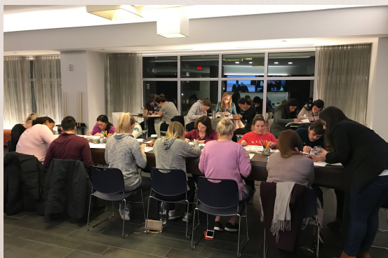
Hand Lettering Workshop at residential building