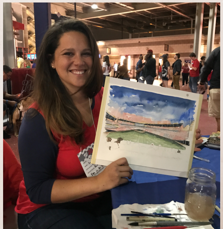
Live Painting at Nationals Park to promote the Humane Rescue Alliance