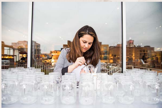
Mason Jar Engraving for Room & Board Party Guests