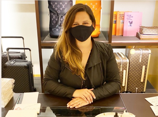
Custom Calligraphy Cards for guests and Louis Vuitton VIPs