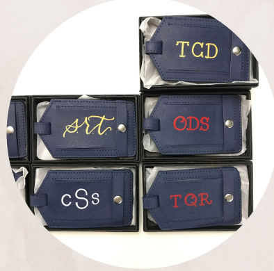
HAND PAINTED LEATHER