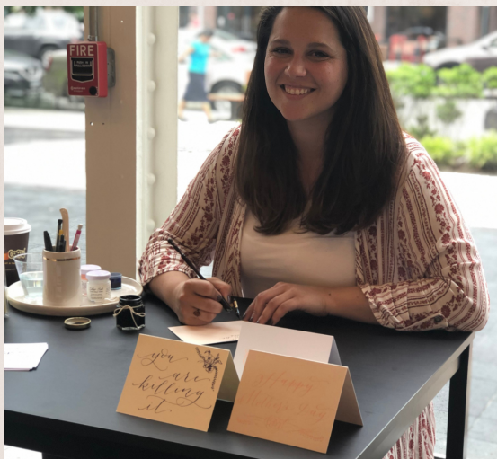
Calligraphy on cards with purchase at Lululemon