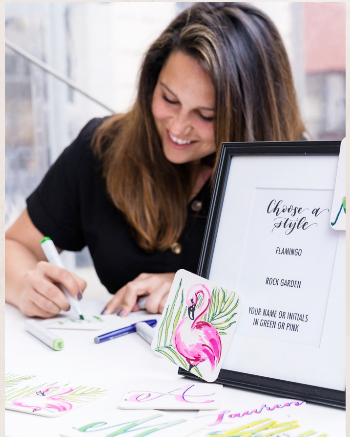
Live Illustrations on coasters for guests at a private event