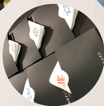
FABRIC AND TEXTILE PAINTING